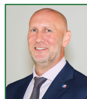
Senior Management Team